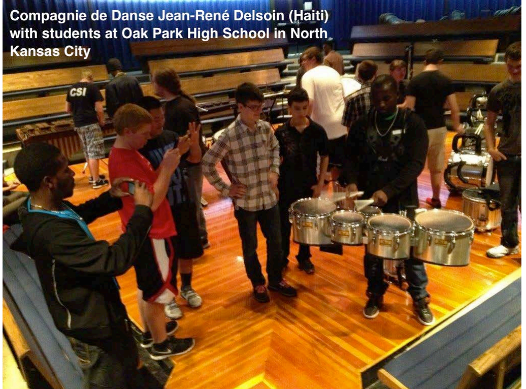
Compagnie de Danse Jean-René Delsoin (Haiti) with students at Oak Park High School in North Kansas City

students, beginning as early as pre-K and extending into college. As part of their contract with the college, performing artists agree to provide residencies or master classes for both students and teachers. Residencies include two or more days of teaching a group of students or teaching a certain aspect related to the artist's skill set. Master classes offer the chance for a more intimate setting – a one-on-one “apex of learning.”